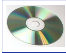
Tracker Tool CD