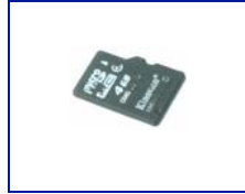
Micro SD memory card (installed in Tracker)